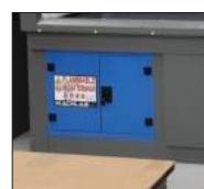
Flammable/corrosive chemical safety cabinet