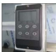
Digital airflow display/airflow regulator