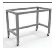
Base support frame with castors