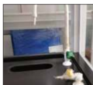
Drip cup, water faucet type and location