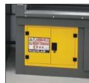
Flammable/corrosive chemical safety cabinet