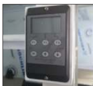
Digital airflow display/airflow regulator