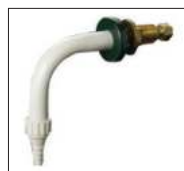
Water faucet type and location