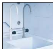
Sink and additional water faucet