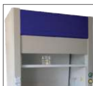
External hood colour variations