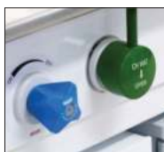
Gas outlet/valve type and location