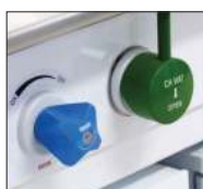
Gas outlet/valve type and location