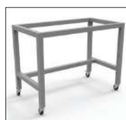
Base support frame with castors