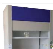
External hood colour variations