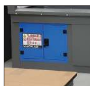
Flammable/corrosive chemical safety cabinet