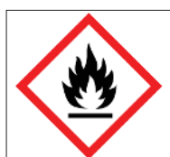
Hazard symbol stickers