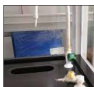
Drip cup, water faucet type and location