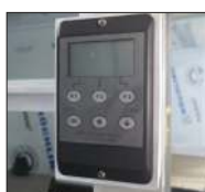
Digital airflow display/airflow regulator