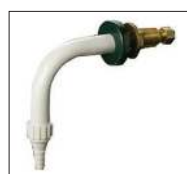
Water faucet type and location