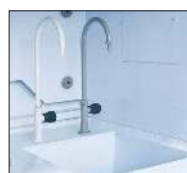
Sink and additional water faucet