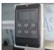
Digital airflow display/airflow regulator