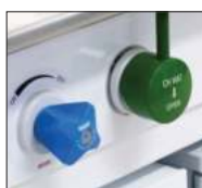
Gas outlet/valve type and location