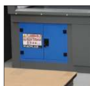
Flammable/corrosive chemical safety cabinet