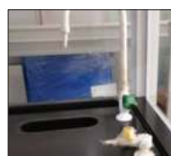
Drip cup, water faucet type and location